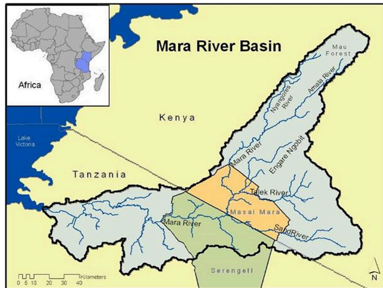
FIGURE 1 | Map of the Mara River Basin (Reza, 2013).

formation phase of the WRUAs. The Water Act (2002) (section 15) and Water Act 2016 anchor these plans at various levels. Concerning the monitoring of environmental flows, it is key to note that this task is not yet in the hands of WRUAs.